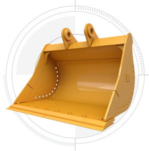
DITCH CLEANING BUCKETS